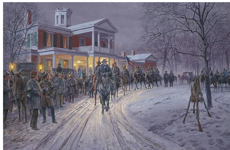
Merry Christmas General Lee