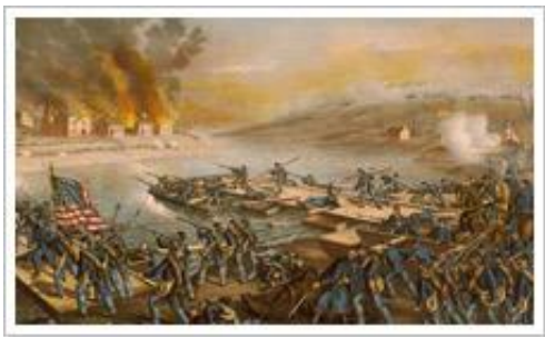
The Battle of Fredericksburg, Va.