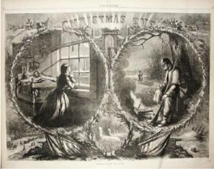
Thomas Nast "A Civil War Christmas"