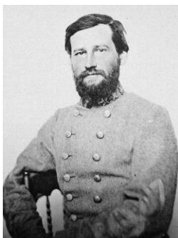
Lt. General Stephen D. Lee

From a speech by Confederate Gen. Stephen D. Lee, presiding officer at the 16th Annual Reunion of the United Confederate Veterans, New Orleans, Louisiana, April 25th - 27th, 1906.