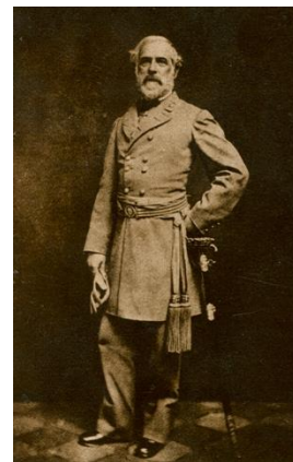
General Robert E. Lee

I salute the Confederate Flag With affection, reverence, and Undying devotion to the cause For which it stands.