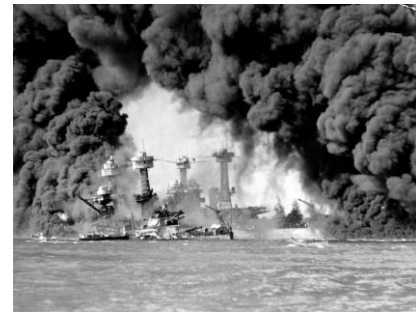
Attack on Pearl Harbor

December 11 – 15, 1862 was one of the largest and deadliest of the War. Robert E. Lee, Watching the great Confederate victory unfolding from his hilltop command post exclaimed, "It is well that war is so terrible, or we should grow too fond of it."