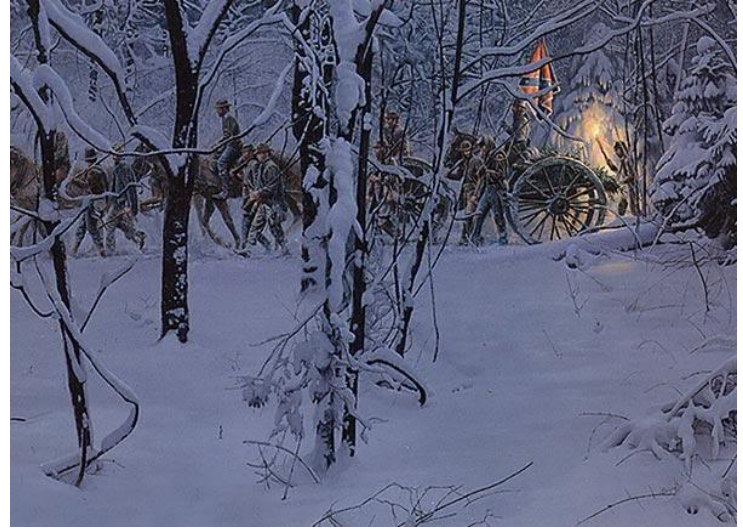
Christmas in the Civil War

aus can be seen. Santa is crawling into a chimney. In the lower left is an image of soldiers marching in the snow. The upper right