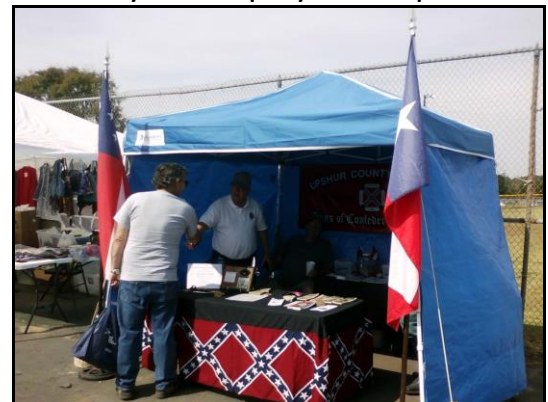
Thank you to everyone that participated and helped with our booth at the Yamboree Festival 2016.