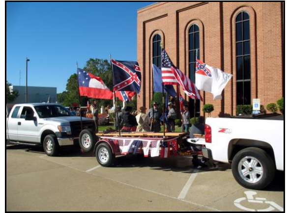
2016 Gilmer Yamboree Parade