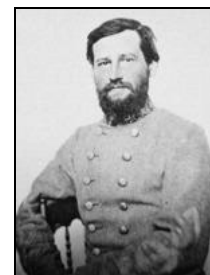
Lt. General Stephen Dill Lee, Commander United Confederate Veterans New Orleans, Louisiana, April 25, 1906.

"Remember, it is your duty to see that the true history of the South is presented to future generations."