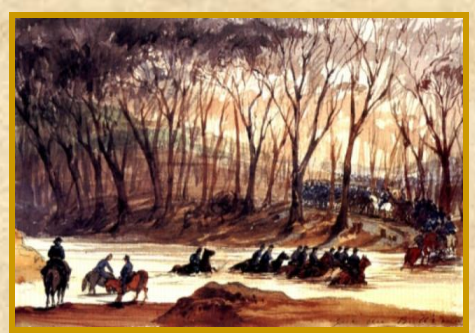
BATTLE OF GREENBRIER RIVER