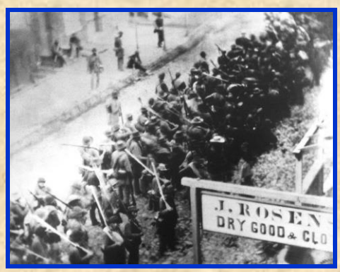
Confederate Soldiers marching through enemy occupied Frederick, Maryland in 1862.

October 30 - Skirmish at Muscle Shoals, Alabama