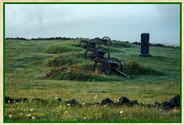
Cemetery Hill at Gettysburg