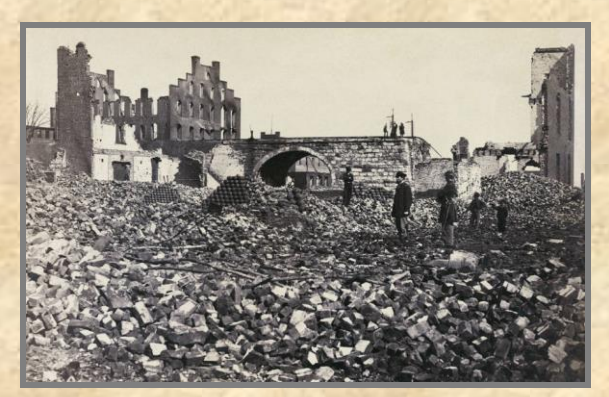
Richmond Virginia April 1865

The Salem Church in Fredericksburg, Va. is an important, yet often overlooked, part of History. The church was used as a hospital by both sides, and it served as a civilian refugee center during the Battle of Fredericksburg. Today, this part of the battlefield has been almost destroyed by urban development.