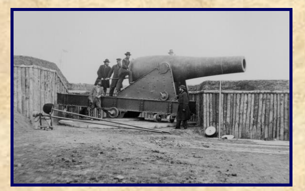
15" Rodman Gun Alexandria, Va.