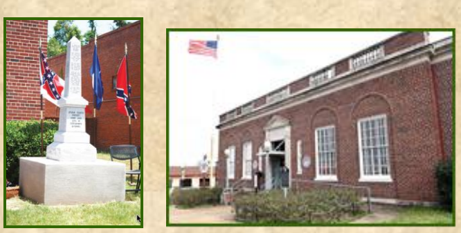
Thank you to the Historic Upshur Museum for providing our meeting location.

Upcoming Events may be found on the Calendar at: <u>www.upshurpatriots.org</u>