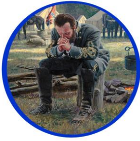
Gen. Stonewall Jackson