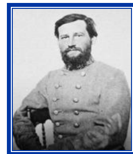
Lt. General Stephen Dill Lee, Commander United Confederate Veterans New Orleans, Louisiana, April 25, 1906.

"Remember, it is your duty to see that the true history of the South is presented to future generations."