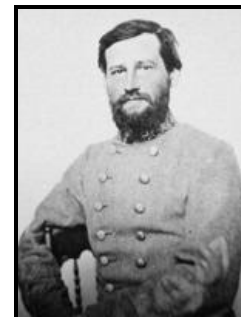
Lt. General Stephen Dill Lee, Commander United Confederate Veterans New Orleans, Louisiana, April 25, 1906.