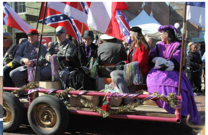
Jefferson Mardi Gras Parade February 2016