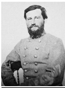
Gen. Stephen D. Lee

The South stood by their beliefs in the existing Constitution, in that it provided for state sovereignty. Southerners felt that they should be governed locally and that the federal government was an agent of the states, to be used to the advantage of all of the states. The South felt that Northern politicians were trying to create a strong centralized federal government. They felt that the North was trying to shift powers away from the states and to the federal government. The tendency toward a greater national power worried practical Southerners who, like Alexander H. Stephens, of Georgia, thought the strong government an instrument for sectional exploitation. "All that we ask of you is - keep your hands out of our pockets," said Stephens.