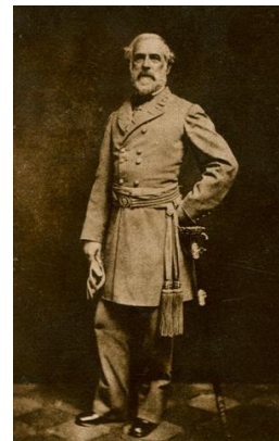
Gen. Robert E. Lee