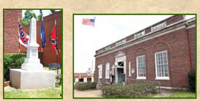
Thank you to the Historic Upshur Museum for providing our meeting location.

Upcoming Events may be found on the Calendar at: <u>www.upshurpatriots.org</u>