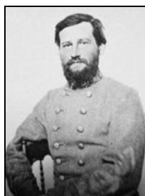
Lt. General Stephen Dill Lee, Commander United Confederate Veterans New Orleans, Louisiana, April 25, 1906.

"Remember, it is your duty to see that the true history of the South is presented to future generations."