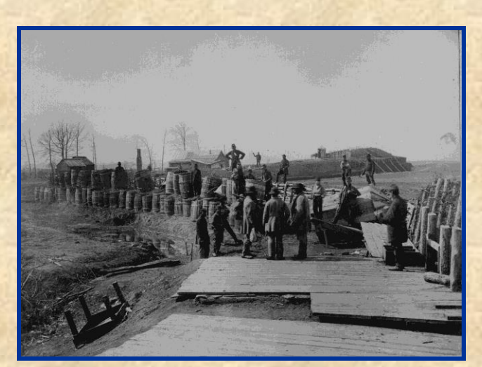
Manasas, Virginia 1862

Upcoming Events may be found on the Calendar at: <u>www.upshurpatriots.org</u>