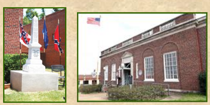
Thank you to the Historic Upshur Museum for providing our meeting location.

Upcoming Events may be found on the Calendar at: <u>www.upshurpatriots.org</u>