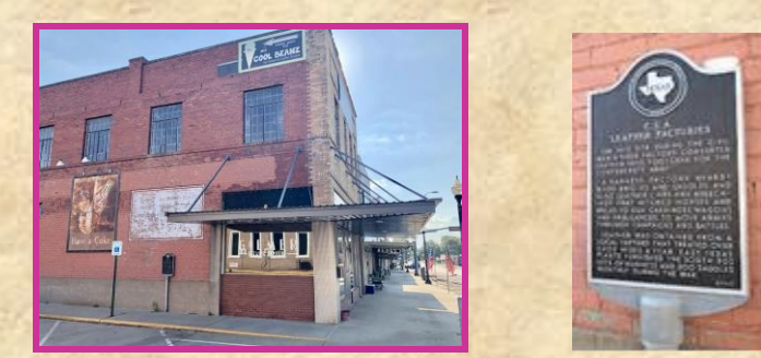
"On this site during the Civil War, a shoe factory converted leather into footgear for the Confederate Army. A harness factory nearby made bridles and saddles and

leather lines and breechings that hitched horses and mules to gun carriages, wagons and ambulances, to move armies through campaigns and battles. Leather was obtained from a local tanyard that treated over 2,000 hides a year. East Texas plants furnished the South 900 sets of harness and 300 saddles monthly during the war."