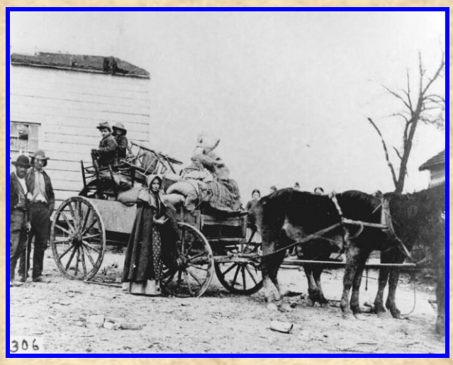
A Refugee Family Leaving a War Area