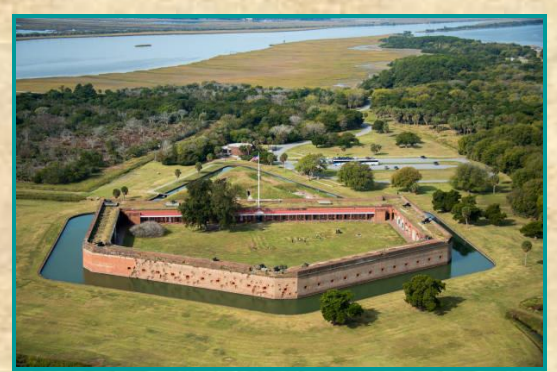
BATTLE FOR FORT PULASKI

January 31-Union naval forces at Charleston Harbor, South Carolina, are defeated in a raid by CSS Palemetto State and CSS Chicora.