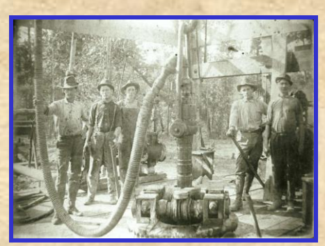
SPINDLETOP JANUARY 1901